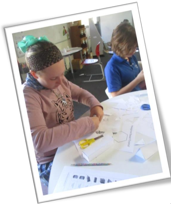
Abbie: Yesterday we were making 3D shapes to count how many faces, vertices and edges they have. We did 7 different shapes. Today I made a cube and it had six different bears on it. My favorite shape is sphere.