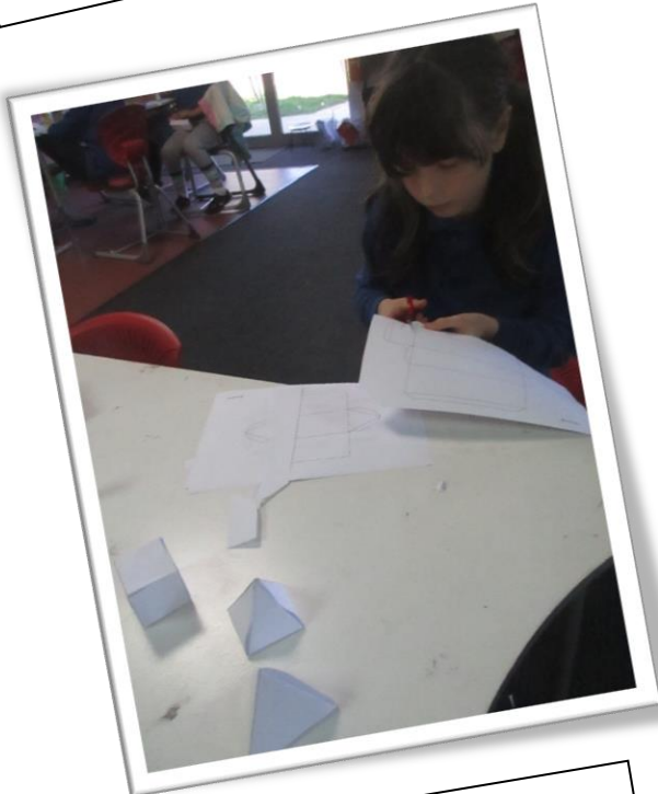
Chloe: Yesterday in math's I made 3D shapes, it was super fun. We made them to learn about 3D shapes and how many sides they have. My favorite shape is a dodecahedron.