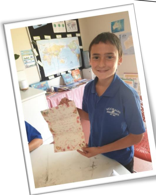
Xaine: At school we are doing a pen pal program. We all have different pen pals from up in Cairns. My pen pal is a girl named Nevaeh.